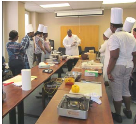
Team HOPE participants learn culinary skills and healthy cooking from instructors at Manchester Bidwell Training Center for Culinary Arts.